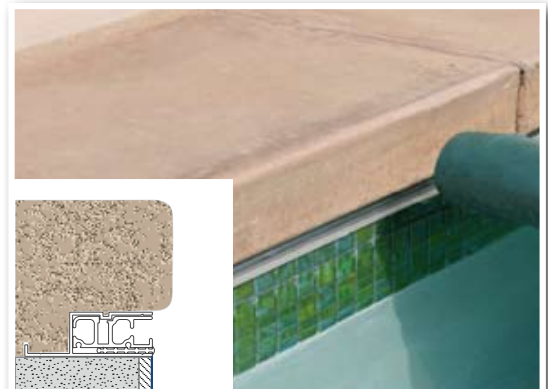
Encapsulated Underguide, Optional feature